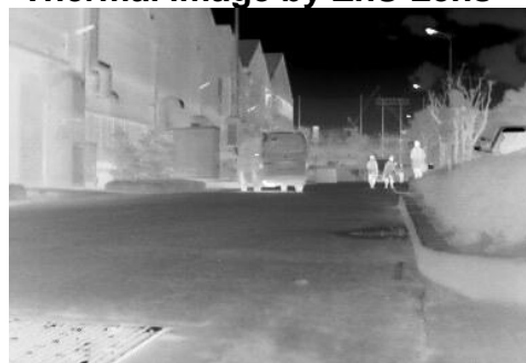
Thermal image by ZnS Lens